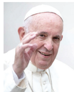
Statement from Frank Cardinal Leo Metropolitan Archbishop of Toronto Following the death of Pope Francis April 21, 2025

Our Catholic family worldwide is in mourning following the death of our spiritual father, Pope Francis. Since 2013, our shepherd has guided the flock lovingly and served as a global ambassador of peace, hope and love. The Holy Father's humility, compassion and care for others, most especially the poor and marginalized, has served as a powerful witness and a reminder of our daily call to reflect the face of Jesus to all those whom we encounter.